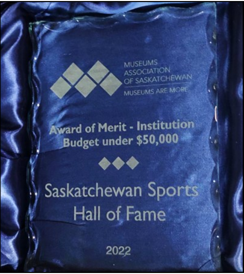
The SSHF received the Museums Association of Saskatchewan’s 2022 MAS Award of Merit for Never Give Up .