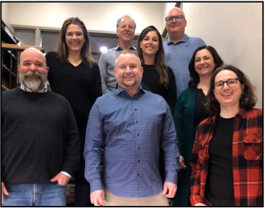
Members of the 2022 Board of Directors at the staff retreat.

With more accolades and an exciting new group of inductees, we are excited to watch the continued growth and success of the Hall of Fame in the coming year.