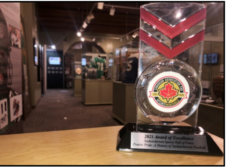
The SSHF received the first CASH Award of Excellence for Prairie Pride: A History of Saskatchewan Football .