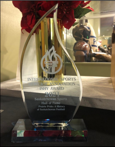
The SSHF also received a 2021 International Sports Heritage Association ISHY Award (above) for Prairie Pride . A still from the virtual tour of the exhibit is shown at left.