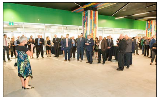
50 th Anniversary Gala, General Admission Lounge