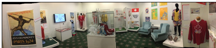
Photo: Panoramic view of our newest display, "Racing for the Rings: Saskatchewan at the Summer Olympics".

Our feature Gallery has also been updated. To celebrate all of our wonderful inductees throughout 2016, a rotating display has been installed in Gallery 1. "Inductees Through the Decades" will rotate every three months to display the inductees from each decade: 60s/70s, 80s, 90s, 00/10s. Currently on display are the years 1990-99.