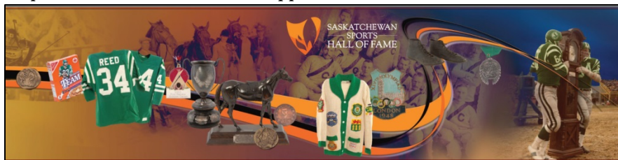
Photo: A sneak peak of the outside of our traveling exhibit. Courtesy of Creative Display.

The SSHF would like to extend a sincere thank you to all of our wonderful sponsors, as the planning and execution of this exciting endeavor would not be possible without all of their support.