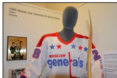
Top portion of the 1985 Moose Jaw Generals display.