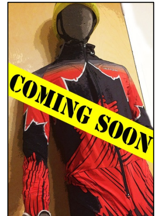
Photo: 2017 Inductee Terry Livingstone’s speed skating skin to be featured in our new exhibit! Courtesy of SSHF archives.

It’s the time of year when we expand membership into a very exclusive club! The number of inductees is going up to 512 with the formal installation of seven new members. The 2017 Induction Dinner is on September 30 th , but the displays representing each new inductee’s career in sport and beyond will be open to the public beginning September 7 th . Come in and see Dedication to Sport: The 2017 Inductees of the Saskatchewan Sports Hall of Fame .