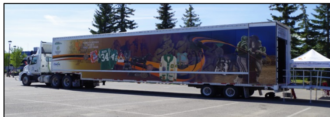
Our traveling exhibit will be on the road from June through September.