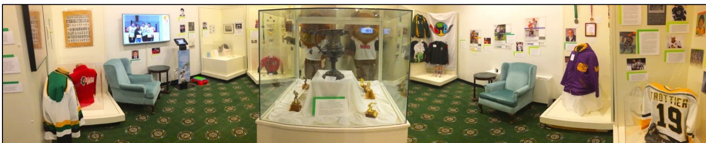
Photos: (Top) Glenn “Chico” Resch’s exclusive personal mask collection. (Bottom) Panoramic view of Gallery 3.